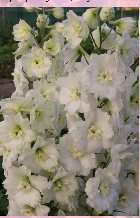
Delphinium Delphi's Diamant