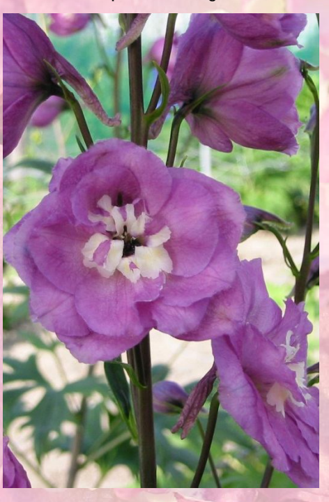
Delphinium Delphi's Saffier