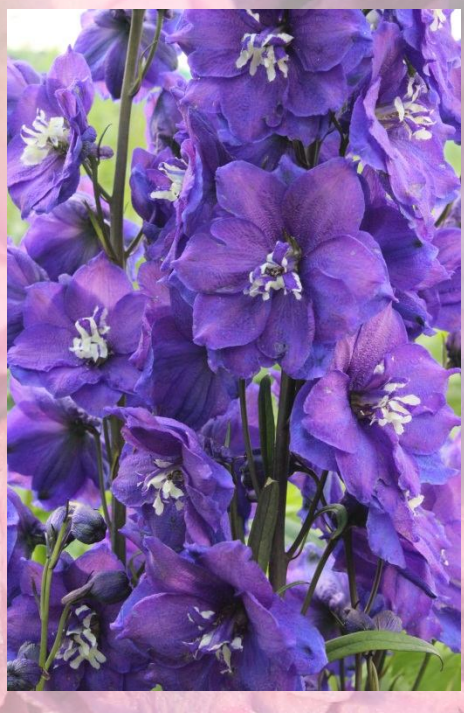
Delphinium Delphi's Power

Delphiniums reign supreme in the summer border. The beautiful colours and striking vertical habit of Delphinium add drama to the mixed borders. Delphinium thrive in any ordinary garden soil. A sunny spot suits them best although part shade is tolerated well.