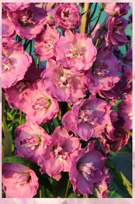
Delphinium Delphi's Pink Power