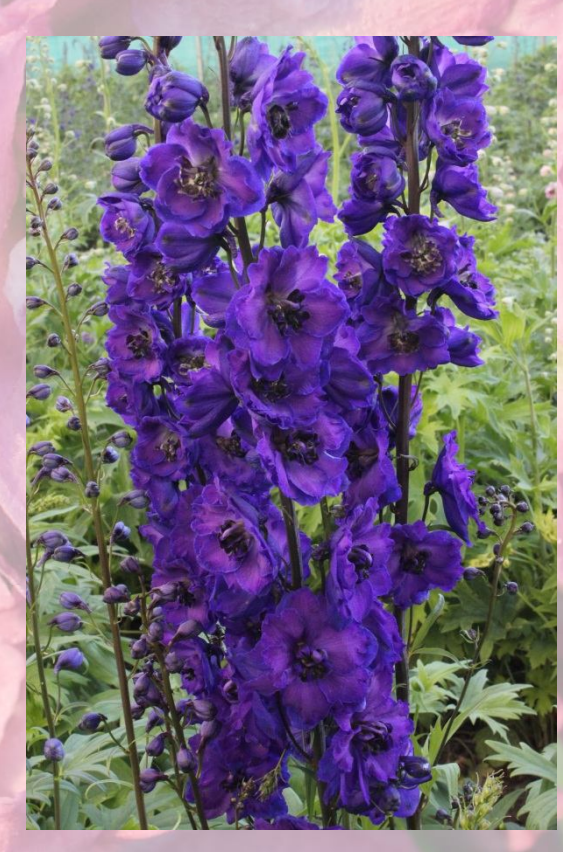
Delphinium Delphi's Jewel