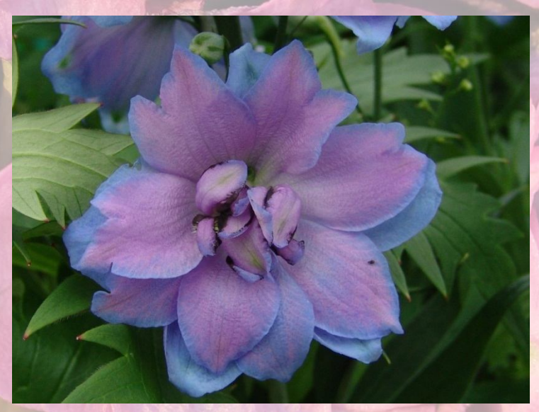
Delphinium Delphi's Starlight

Delphiniums stand out in the garden like rockets or fireworks that have left their blazing trail standing in the air, the most vigorous and meaty verticals the summer garden can provide. Their gorgeous blooms also make outstanding cut flowers.