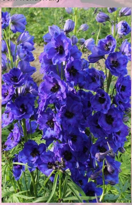
Delphinium Delphi's Hollands Glorie

Delphiniums of all descriptions are very worthy garden plants and the greatest majority of the time it is the seed raised strains that are offered. There is nothing wrong with such plants. They tend to represent very good value. But there are also a great number of vegetative propagated named varieties that perhaps represent the pinnacle of the Delphinium grandeur. These varieties of Delphinium are much less often offered but their unique beauty is exactly replicated and maintained. The better named varieties often re-bloom. They are aristocrats of pure indulgence, and make sparkling plants for the border. Towering spikes clad in colourful florets are borne throughout the summer months.