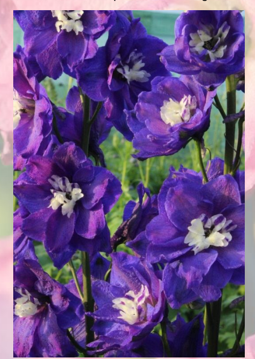
Delphinium Delphi's Emerald

Delphiniums are one of the classic summer flowering border plants. Unmistakeable in appearance, the towering spires of Delphinium rise above neighbouring plants, lending an air of stately poise to any area. Delphinium is an elegant perennial, which makes the garden truly splendid. Every year they astonish you by their regal colours and elegant stature. They come in an array of beautiful colours but are most famous for their astounding blue shades, from the deepest navy through almost black, lively kingfisher blues, cool and tranquil silvery lavenders and sky blues, but they also come in white and several pink shades from lilac through strawberry rose and mulberry. Many varieties have a contrasting 'bee' or middle in the centre of each flower, which can be black, silvery grey or white. Delphiniums peak bloom period is early to midsummer and may continue late into the fall. Delphinium is extremely hardy and are one of the easiest plants to grow. Even when planted in a less than ideal spot and never get around to pampering them, they still thrive and bloom wonderfully.