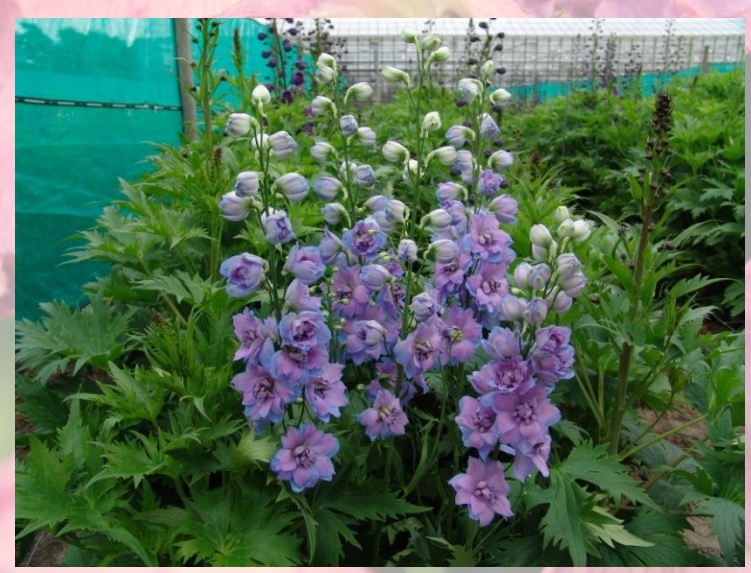
Delphinium Delphi's Starlight

Delphiniums reign supreme in the summer border. The beautiful colours and striking vertical habit of Delphinium add drama to the mixed borders. Delphinium thrive in any ordinary garden soil. A sunny spot suits them best although part shade is tolerated well.